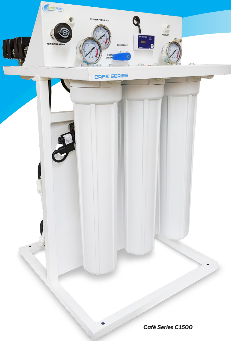
Café Series C1500