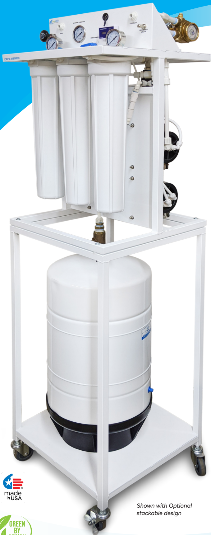
Shown with Optional stackable design